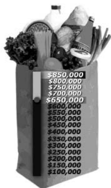
Fundraising Goal - 2006 Progress Tracker

Thank you for being part of the Good Shepherd Food-Bank family!!!!